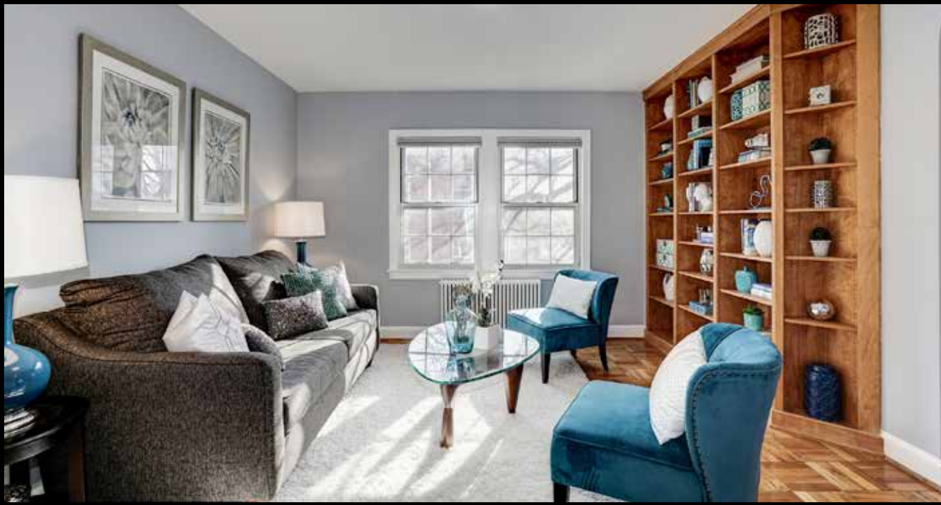
Open Living Room